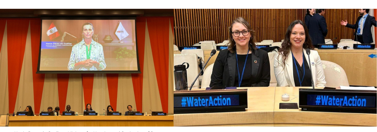
Hania Perez de Cuellar - Minister for Housing and Sanitation of Peru